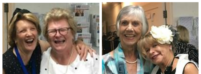
Club Willoughby – Rookie Winners