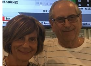
East Lindfield – Open Winners