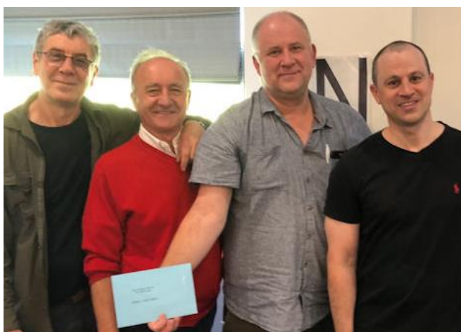
Winners: Southern Highlands Teams