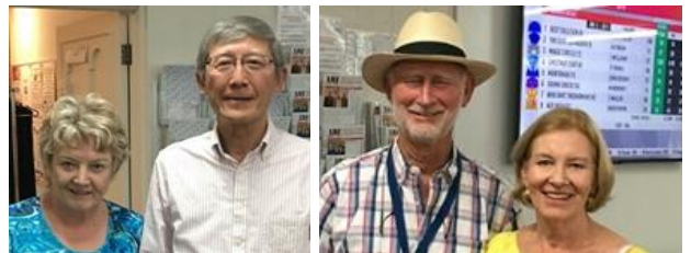
Club Willoughby – Open Winners