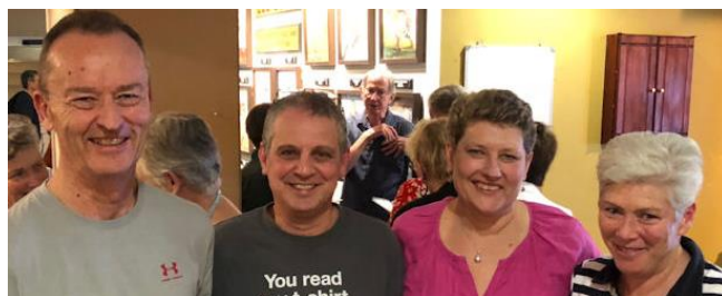
Winners: Manly Teams