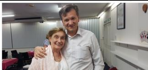
North Shore Bridge Club