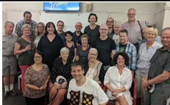
The 2019 winning Trumps team