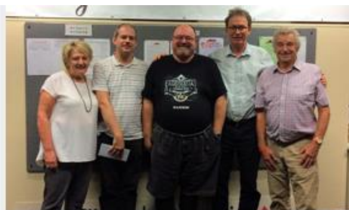
2019 Open ITS Winners