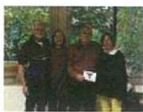
Teams Of Three Winners