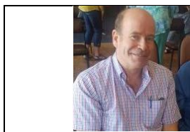
NSBC New 2020 President