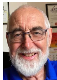
2 nd Tim