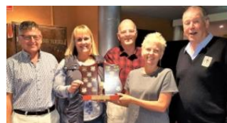
Winning Peninsula & Trumps Teams