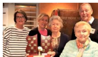
Winning NSBC Open & Intermediate Teams