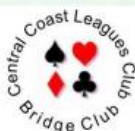
Table limit is 40