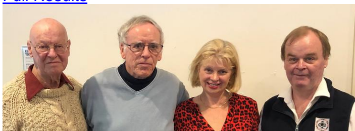
2 nd - Prescott Team