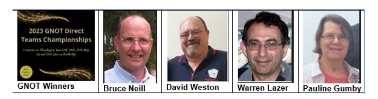
NSBC - GNOT Honour Board